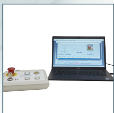
Advanced software interface defining eBt or SRT treatment parameters successfully