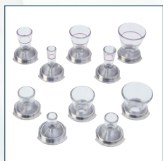
Smarter, dual modality treatment system with SRT and eBt capability

RADiant is the first dual-modality surface radiation therapy system offering a non-surgical treatment alternative that's smart, simple and successful—for your patients and your practice.