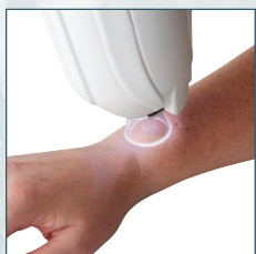
Simple positioning with illuminated halo applicators